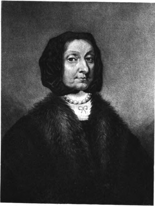
Elizabeth Steward: Mother of Oliver Cromwell.